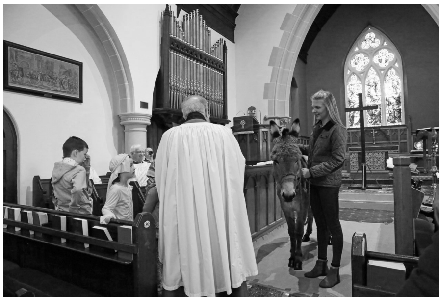
Palm Sunday at St Bride's: Teaching the children.