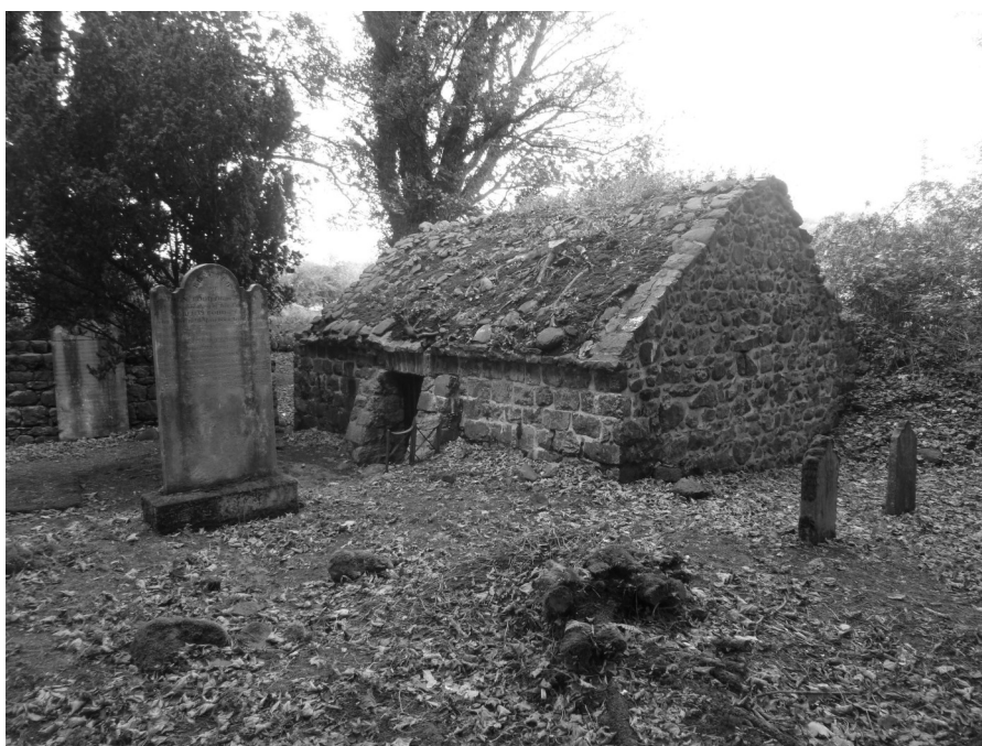
The old mort house at Rashee, said to have been built from the stones of the ruined first church.

Then we will move across the parish to a field at the far end of Posy Hill, the site of the second