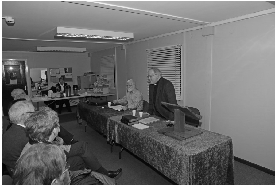
The General Vestry: The meeting begins.

“I firmly believe that most of our regular worshippers come to church because they want to