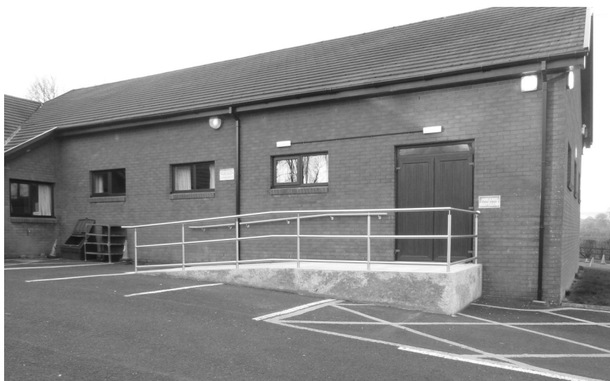
The new exit and access ramp for those with disabilities at the rear of the Parish Hall. This was provided to ensure compliance with the law!