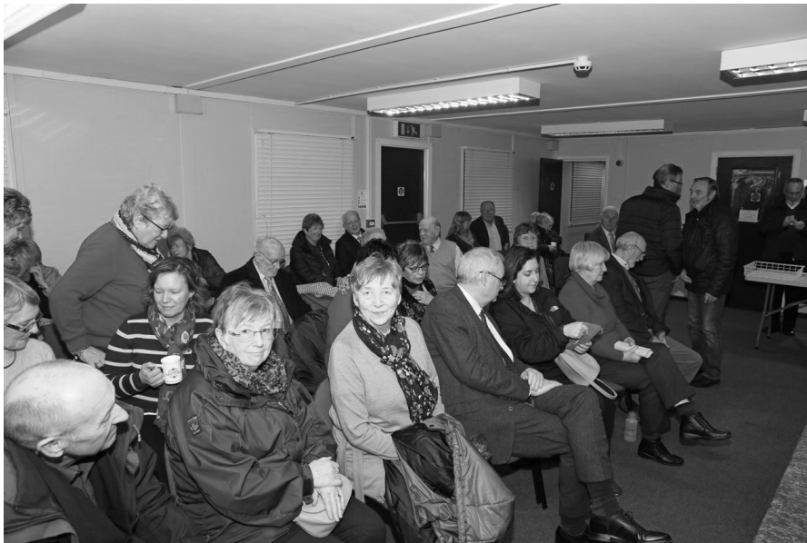
The General Vestry: Almost ready to start.

"I usually only mention by name a very small number of people, normally only those who are